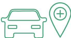
DRIVE THRU PHARMACY